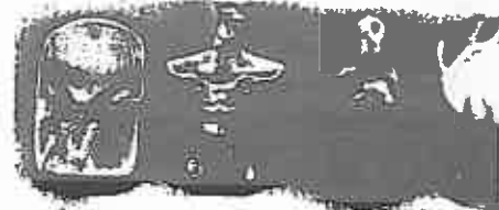
Mountain Goat, $525. Eagle, $1,300. Chimp, $1,250. Etc.