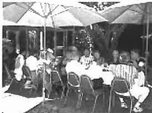
Eating again! Palm Springs