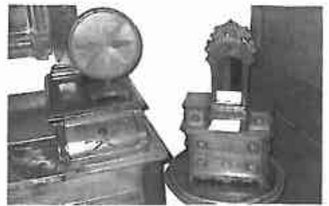
Miniature Antique Furniture - Salesman Samples