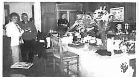
Plenty of food!