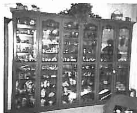
Judy's Collection of RB