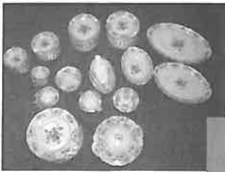
16 pc. Place setting Royal Bay dishes $355.00