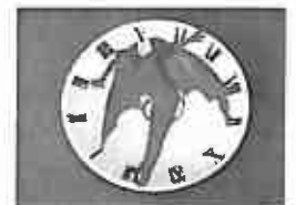
Devil Clock plate $1,575.51