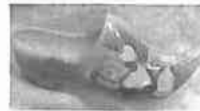
Sunbonnet Dutch Shoe, girls washing $420.00