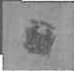
Mark for 16 pc. Place setting