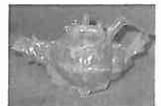
Spikey Shell Teapot $72.00