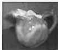
Apple Creamer $63.00