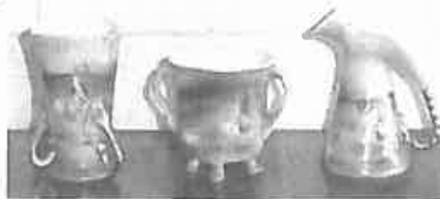
3 pc. man, lady, chicks, $139.50