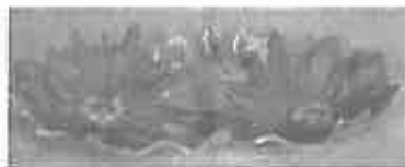
Poinsettia dish $225.39