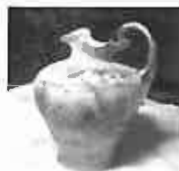
Men in Boat Fishing Ewer $59.99