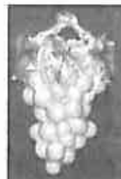
Grape Wall Pocket $255.00