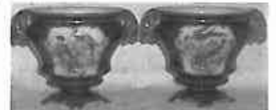
Pr. Of Jardinleres with birds $100.00