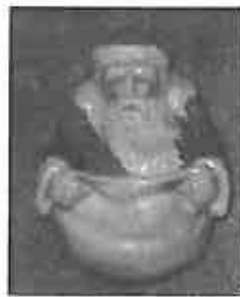
Santa Wall Match $5,352.52