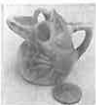
Mini Lobster Creamer $76.00