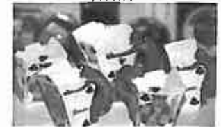
4 Pcs. Devil and Cards $599.00