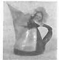
Milkmaid Creamer $180.00