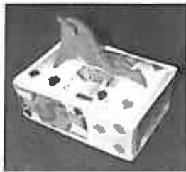
Devil Card Box $644.00