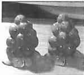
Grape Salt and Pepper Shakers $138.50