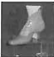
Shoe, two toned $39.99