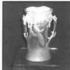
Vase with Peacock $201.17