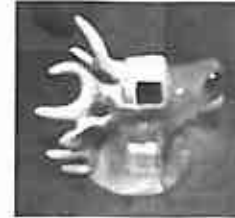
Elk Open Matchbook Holder $440.00