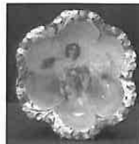
Portrait Bowl lady with shawl $250.00