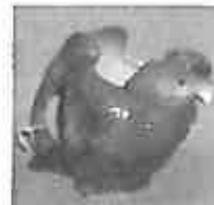
Parakeel Creamer $133.50