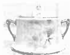
Hand Painted Ivory Biscuit Jar $275.00