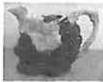
Grape Creamer $75.00