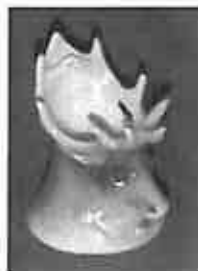
Elk Toothpick $165.49