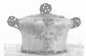
Biscuit Jar with roses $56.00