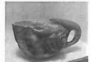
Shell Creamer with Lobster $255.00