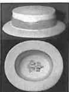
Straw Hat and mark inside $189.16