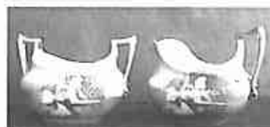
Sunbonnet creamer and sugar girls ironing $128.50