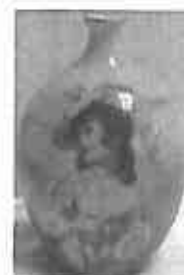
Vase, Lady in Hat $67.51