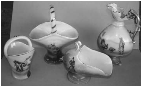
Left to right: Coal Scuttle. Flower Basket. Coal Scuttle Ornate Urn

The notes and pictures on Miniatures in the June issue raise the question as to what exactly is to be classified as a miniature for Royal Bayreuth collectors. By one definition, many of the scenic pieces, plentiful here in New Zealand, are miniatures in the sense that they are tiny versions of shapes that would have been commonplace on the dining tables of Bavaria in the early years of the 20th century when the Tettau factory was producing such a wondrous array of shapes - vases, urns, baskets, candlesticks etc as well as the vast array of shapes now called TPH's. Here are four pieces from my own collection which might be described as miniatures.