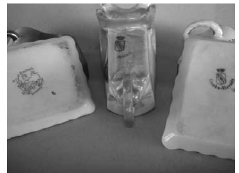
This photo shows (left to right) the familiar Bayreuth Blue Mark on a Cheese Dish base. The base of the Wheelbarrow shows the GEMMA Crown & Crest, and the word "Austria", while another Cheese Dish base shows the GEMMA Crown & Crest over the name "Czecho-Slavakia". It's all a bit of a puzzle!

Finally, a question. Can any of our readers offer a clue as to the origin of the GEMMA mark?