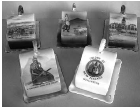
Four GEMMA Cheese Dishes and one Royal Bayreuth featuring left to right; Dunedin and Harbour (my home city); A Poketeraki Maori; The Goosegirl (R.B.); Colony of New Zealand, Wellington (New Zealand ceased to be a colony of Britain in 1907); Post Office, Invercargill NZ.

apparent that in the colonial years in New Zealand there were a large circulation of European pieces made for the souvenir shops that grew up in the locations made popular by early tourists and holiday-makers. Most prominent among these were Royal Bayreuth and Gemma. Photos or pictures were apparently sent to the factories in Europe and transferred to a very wide range of tiny shapes designed as souvenirs of the various tourist attractions. I have seen many of these Gemma items in New Zealand antique shops over the years, and I wish now I had collected them seriously for inevitably they sold much cheaper than Bayreuth. The molds for the Mini cheese dishes are almost identical to those very collectable Royal Bayreuth equivalents.