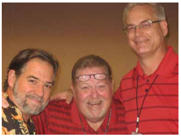
Doings in Dayton