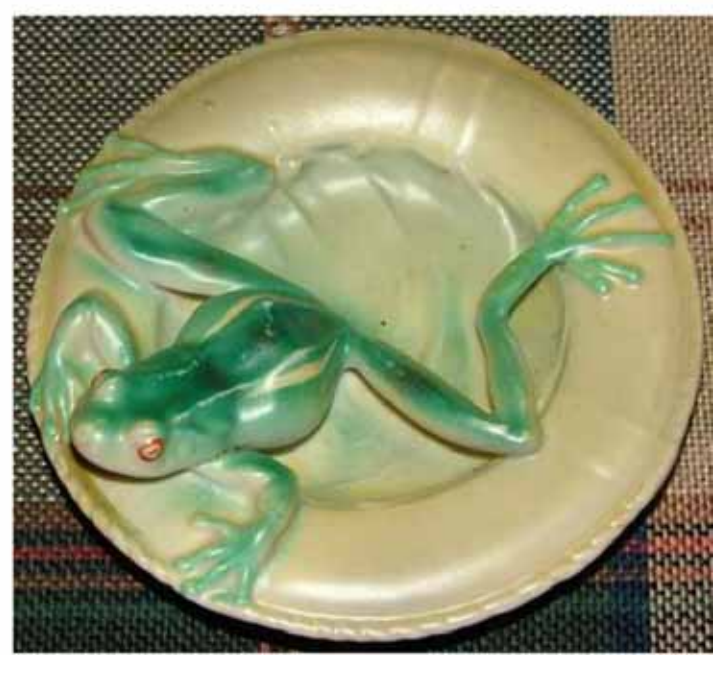
Odds of March