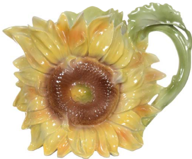
Sunflower Water Pitcher - 6.5" Royal Bayreuth (Blue Mark) Yellow and Green Tones $1,000