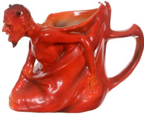
Red Devil Water Pitcher - 6.25" Royal Bayreuth (Blue Mark) Full Figure - Very Rare $1,600

We hope everyone enjoyed the Woody Auction in February held in their new showroom and online via Liveauctioneers.com. Below are some gems from that sale. Prices are final bid without any fees or taxes. All sale results are available on the Liveauctioneers website.