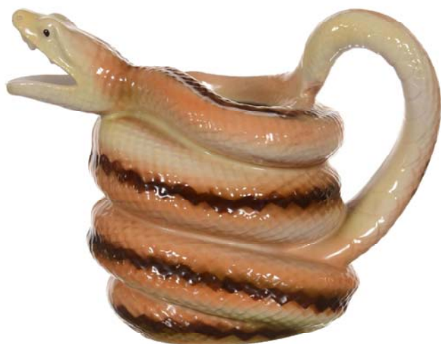
Snake Water Pitcher - 6.5" Royal Bayreuth (Blue Mark) Excellent Quality - Very Rare $800