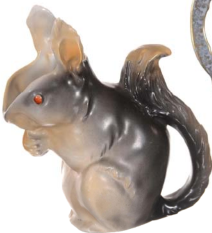
Squirrel Creamer - 4.75" Royal Bayreuth (Blue Mark) Gray Squirrel Excellent Condition $450