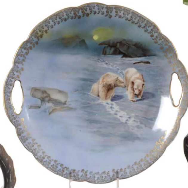
Cake Plate - 10.5" Royal Bayreuth (Blue Mark) Rare Polar Bear Scenic Decor - Gold Stencil Trim $350