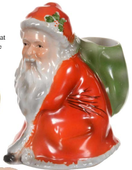
Santa Claus Match Holder/Striker - 4.25" Royal Bayreuth (Blue Mark) Red Jacket - Excellent Quality $1,000