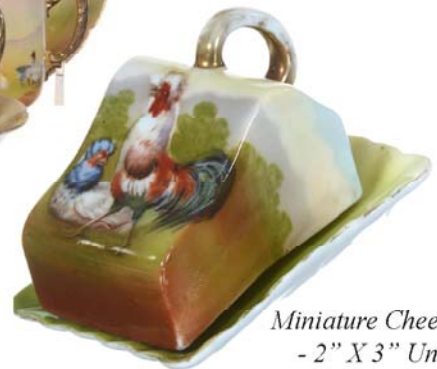
Miniature Cheese Dish - 2" X 3" Unmarked Royal Bayreuth Scene of Rooster and Hen $200