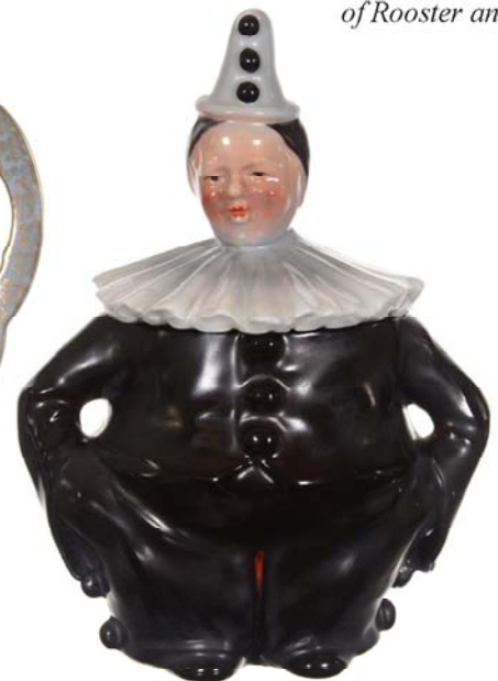
Clown Humidor - 9" Royal Bayreuth (Blue Mark) Black Suit $800