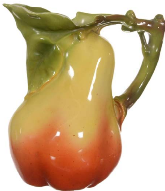
Pear Water Pitcher - 7.5" Royal Bayreuth (Blue Mark) Yellow, Orange and Green Tones $500