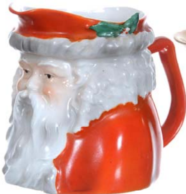
Santa Claus Breakfast Creamer - 3.75" Royal Bayreuth (Blue Mark) Red Jacket - Very Rare Shape $2,500