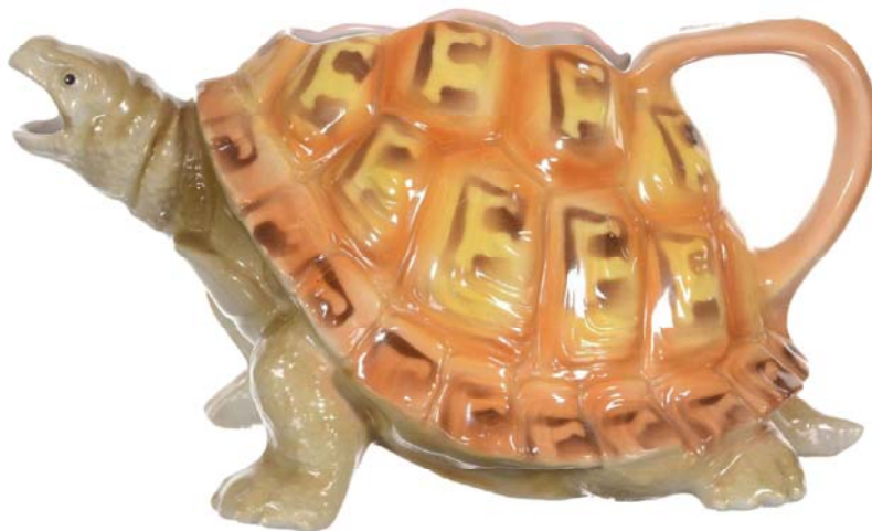
Turtle Lemonade Pitcher - 4.75" Royal Bayreuth (Blue Mark) Very Rare $750