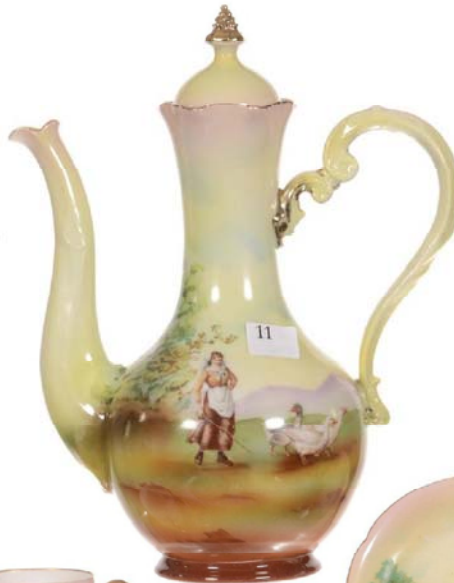
Demitasse Set - 9.25" (Blue Mark) Pot with (4) Matching Cups and Saucers - Woman and Geese Scenic $450