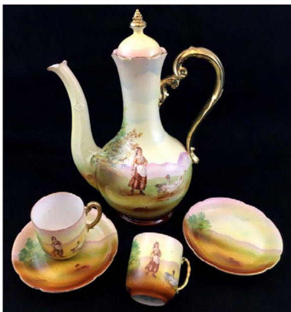
Club Auction preview on page 12.

We are looking forward to seeing old friends and meeting new in Cincinnati this year and those not able to be there don't forget to get those absentee bids in early! Good hunting to all!