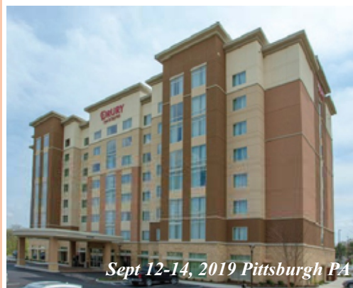
Sept 12-14, 2019 Pittsburgh PA