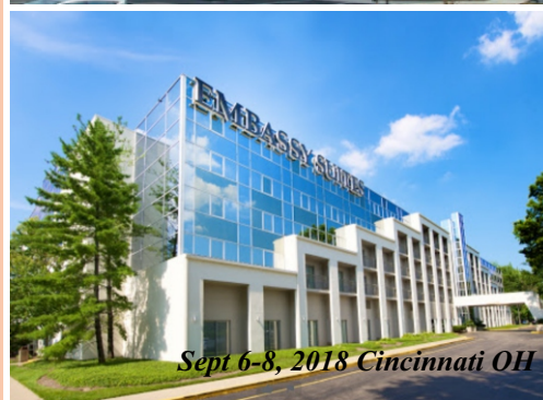
Sept 6-8, 2018 Cincinnati OH