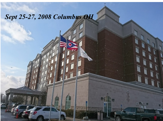
Sept 25-27, 2008 Columbus OH