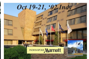
Oct 19-21, '02 Indy