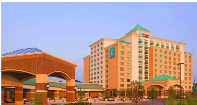
Oct 16-18, 2014 Saint Charles MO