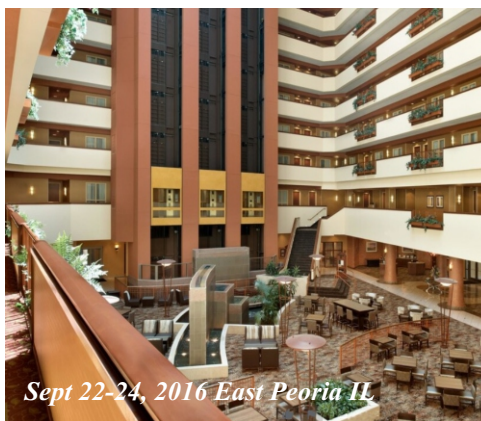
Sept 22-24, 2016 East Peoria IL