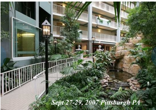
Sept 27-29, 2007 Pittsburgh PA