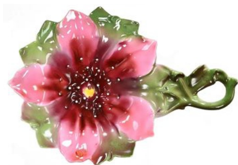
Tea Strainer, Unmarked, 5.75" x 4", Floral Mold, Harold Brandenburg Collection $275.

We are no longer compiling sales lists from the 3 most popular web sites (links below). But we did see a few pieces of special interest since the Spring issue. Sale prices rounded to nearest dollar with no fees or shipping.