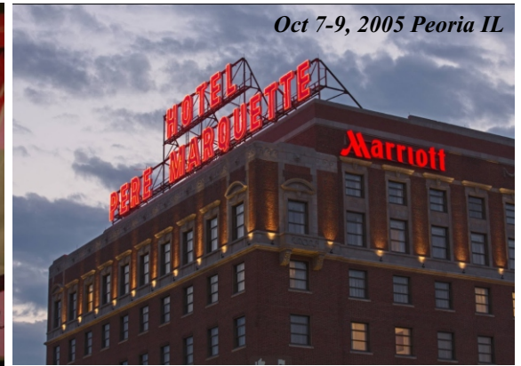
Oct 7-9, 2005 Peoria IL