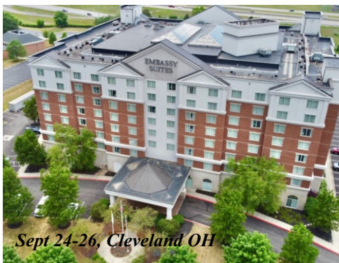
Sept 24-26, Cleveland OH