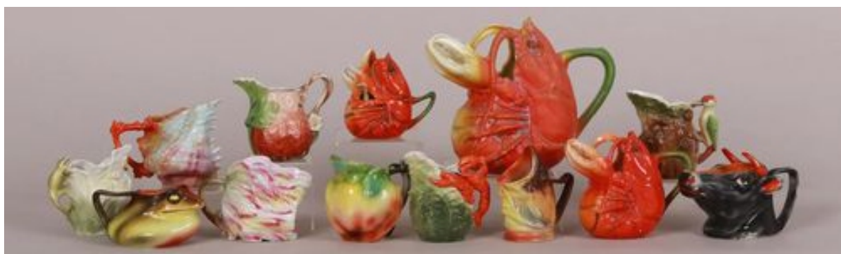
Eleven creamers, some unmarked most attributed to Royal Bayreuth $250.

LiveAuctioneers: https://www.liveauctioneers.com/search/?keyword=royal%20bayreuth&sort=-relevance&status=online