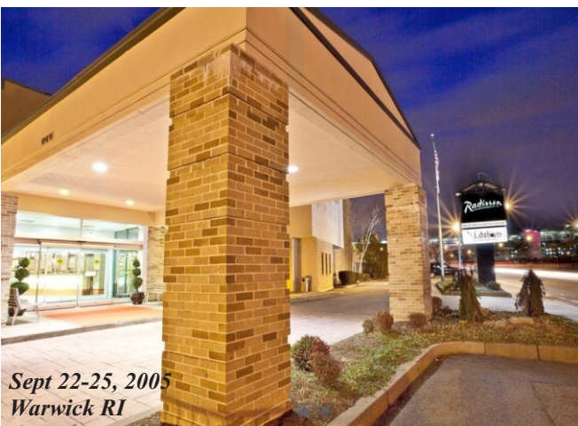
Sept 22-25, 2005 Warwick RI