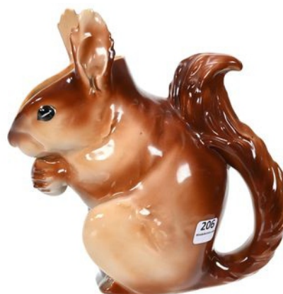
Water Pitcher Marked Squirrel, 8" x 8.25", Perfect Ears, Bob Gollmar Estate $4,500.