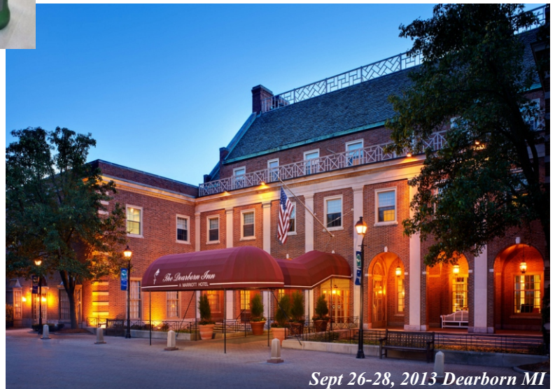
Sept 26-28, 2013 Dearborn MI