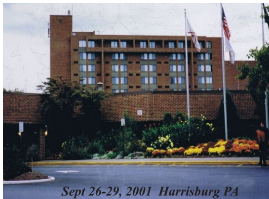
Sept 26-29, 2001 Harrisburg PA