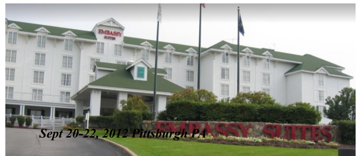
Sept 20-22, 2012 Pittsburgh PA