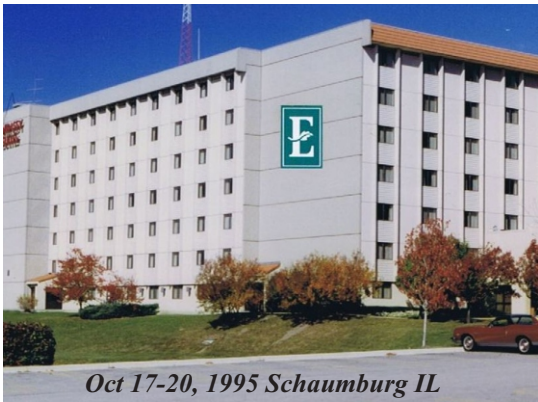
Oct 17-20, 1995 Schaumburg IL